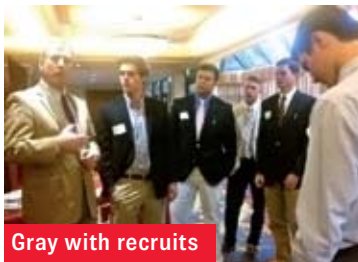
Gray with recruits

KU SigEp is looking to recruit young men with a track record of academics and leadership skills that will transcend to their experience in the house. We are very involved with looking at the background of their high school activities to see a history of achievement with whatever activity they are involved in.