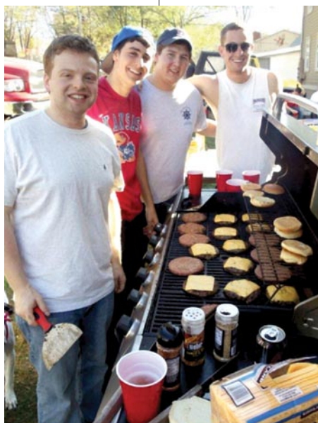
KU SigEps cook out on a Friday afternoon.