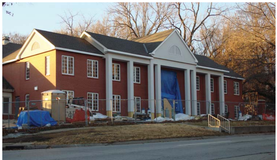
January 1, 2009 • Final touches underway