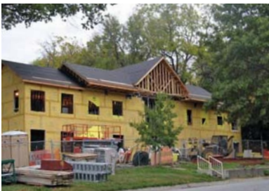
October 24, 2008 • Before the brickwork begins