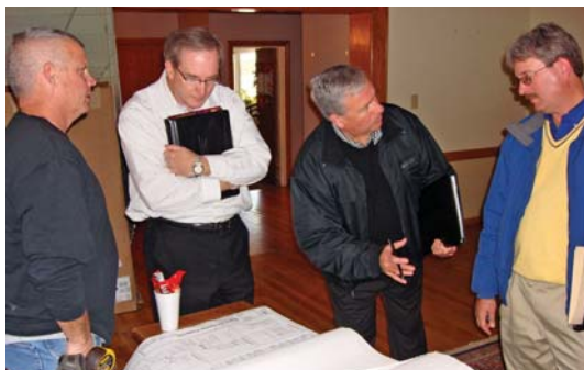
October 28, 2008 • Reviewing the plans