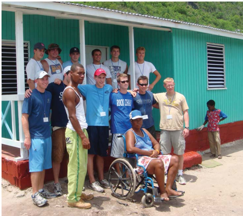
LEFT: BROTHERS POSE IN FRONT OF THE HOUSE THEY HELPED FOOD FOR THE POOR BUILD THIS SUMMER.

Log on to kusigep.com to see how KU SigEp's are making a difference.