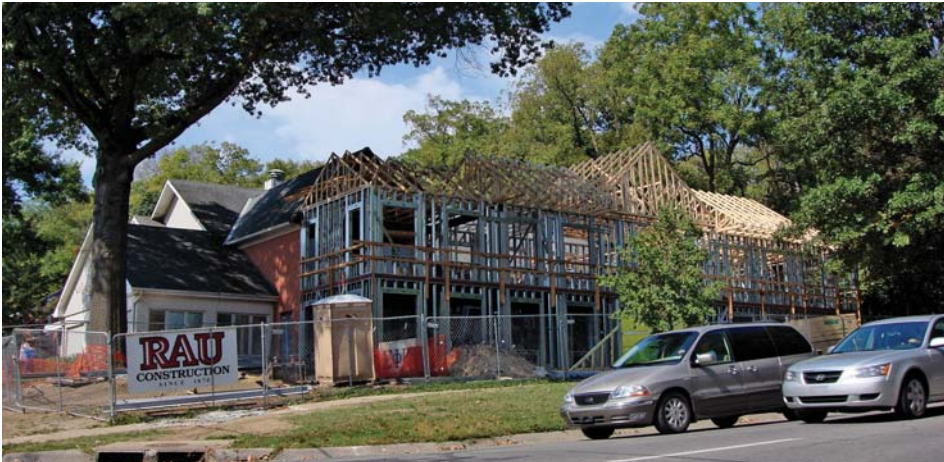
October 4, 2008 • 17th & Tennessee looks different, huh?