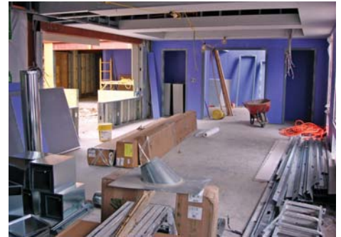
November 8, 2008 • A look inside progress on the new formal living room