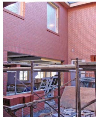
November 25, 2008 • Two story courtyard with second level deck