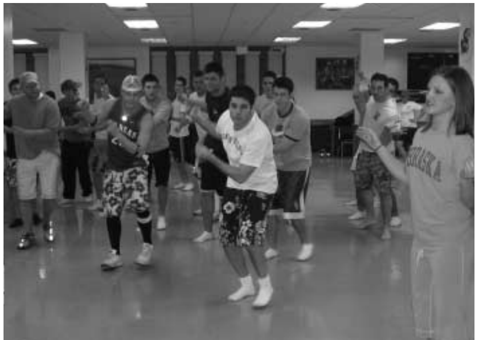
THE MEN OF KU SIGEP "WORK IT" TO LEARN DANCE STEPS FROM THE ORIGINAL PRESENTATION OF "LITTLE PROM ON THE PRAIRIE" FOR THE ROCK CHALK REVUE BENEFIT FOR UNITED WAY OF DOUGLAS COUNTY.