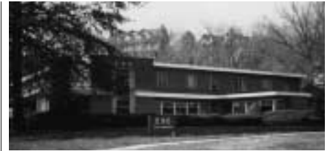
THIS IS THE KANSAS GAMMA CHAPTER HOUSE AS IT WAS ORIGINALLY BUILT IN 1949. THE INTERIOR WAS REMODELED IN 1981.