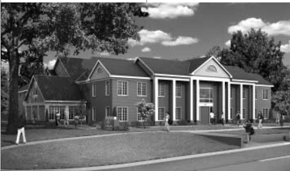
THE NEW HOUSE AT 1645 TENNESSEE WILL BOAST A BEAUTIFUL NEW EXTERIOR, MORE STUDY ROOMS, A LIBRARY/LIVING ROOM, A COURTYARD, A CHAPTER EDUCATION ROOM, AND A TV/GAME ROOM.

Today, once again, upgrades in housing are necessary to remain competitive on the KU Campus. The "KU SigEp Now" Campaign, only the second capital campaign in Kansas Gamma's history, is underway. With the proposed renovation, Kansas Gamma has the chance to finally offer housing that is truly competitive. A new hall on the second floor, extending to the east, will feature larger rooms with a view facing Tennessee Street. And, the new hall will not have a traffic pattern, so the rooms should be quieter. These rooms will be helpful in retaining upper-classmen and, thus, reducing New-Member class sizes. Additionally, three larger rooms will be added on the lower level, which should add some "life" to the first floor common areas. A beautiful living room with large windows will face Tennessee Street, and a TV/Game Room will replace the current Chapter Room. With the additional rooms, we're