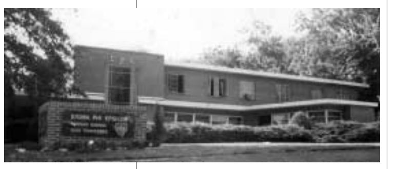
large first floor resident bath.

interior areas including all sleeping rooms, the entry foyer, and the dining room, and construction of an additional