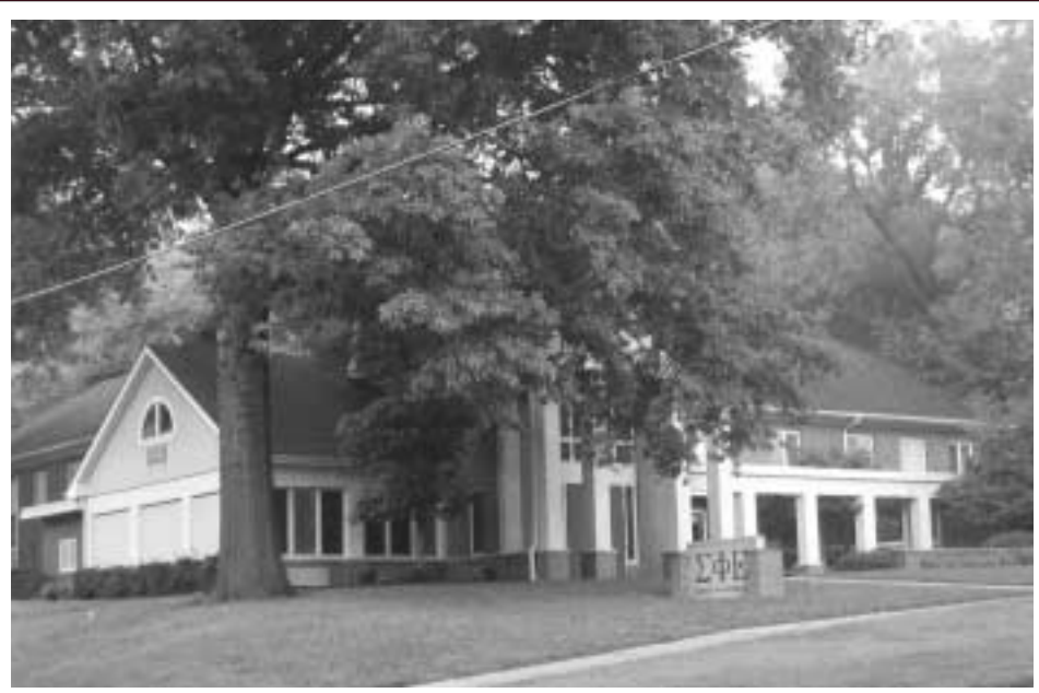
current chapter facility from 17th and Tennessee, looking northwest

semester. This is predicated on building sufficient cash balances prior to commencement of construction.