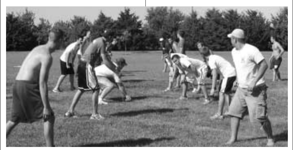
KU SIGEP MEN IN INTRAMURAL FOOTBALL ON CAMPUS

living somewhere else, living at the "Sigma" probably is one of the best decisions I will ever make!