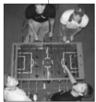
UNDERGRADS ENJOYING A FEW MINUTES OF "STUDY RELIEF" PLAYING FOOSBALL

The reinforcement of ideals is one of those things that will probably live