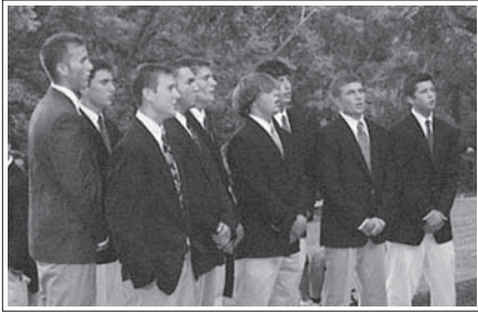
NEW MEMBERS SERENADE THE SORORITIES