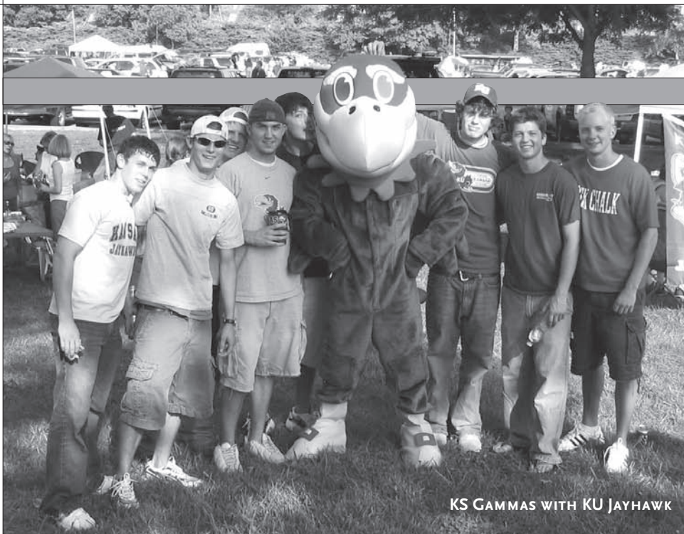
KS GAMMAS WITH KU JAYHAWK

THESE INDIVIDUALS VOLUNTEER THEIR TIME OUT OF A DEEP-SEATED FEELING OF "BROTHERLY LOVE" FOR AN ORGANIZATION THAT HAS OBVIOUSLY MADE A DIFFERENCE IN THEIR LIVES.