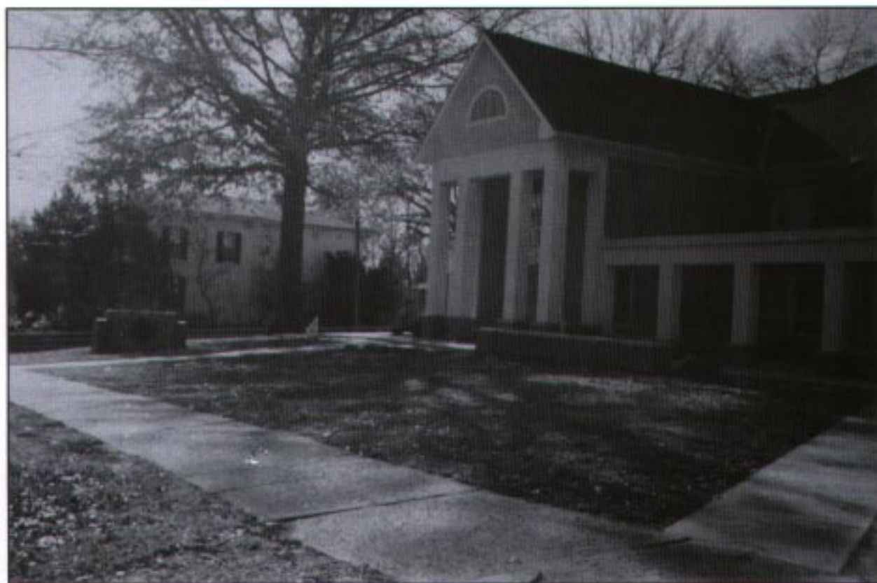
THE EP LODGE: 1645 TENNESSEE

In the ever-changing business world, working well in group situations has become increasingly important. The new executive structure at Kansas Gamma allows the brothers an opportunity to hone their skills before entering the work force. In addition, the new system insures that objectives are achieved quicker and better. It all adds up to a better Sig Ep!