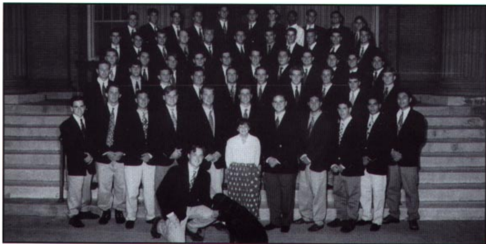
THE MEN OF KANSAS GAMMA 1994-95