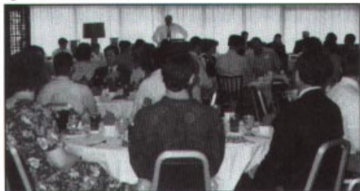
The 1995 Balanced Man Scholarship Luncheon