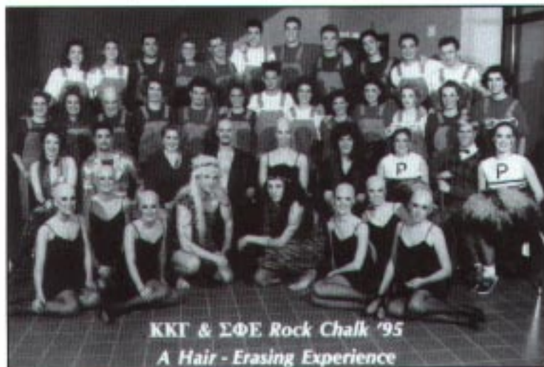
Kansas Gamma in Rock Chalk Revue 1995!