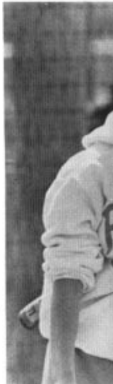
★ ...And misses