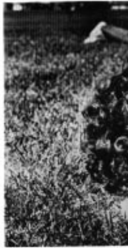
★ A cream-eating co